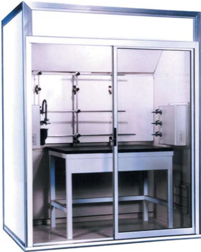
UNIMAX Floor-Mounted Hood #50601 shown with optional table, apparatus grid, and service fixtures.

The Unimax Walk-in Fume Hood encloses your workspace to safely contain and vent vapors or contaminants. Available in standard or explosion proof models in 72", 96", 108" or 144" widths