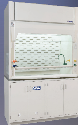
UniFlow SE AirStream High Performance Energy Efficient Laboratory Fume Hoods