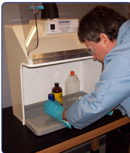
1. 24000 with Safety Shield in the Up position