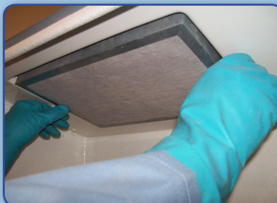
2. Set filter in filter frame, Note: arrows indicate direction of airflow.