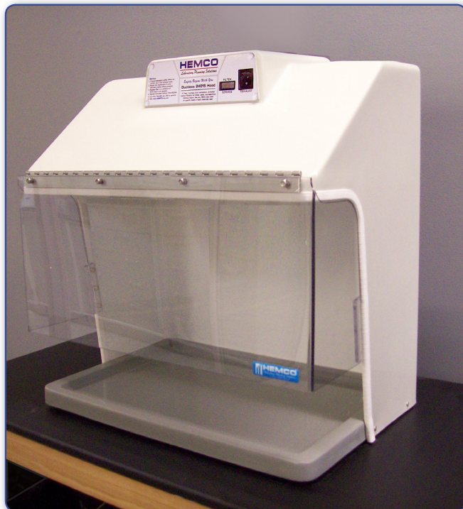
Shown with optional Safety Shield