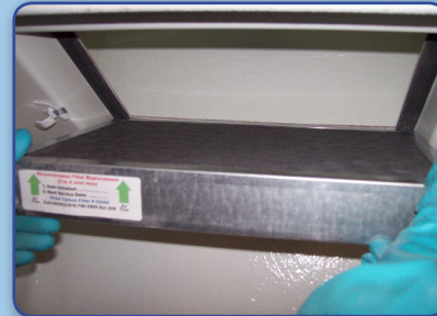
3. Snap the right and left stainless steel filter clamps, to secure the filter in place.