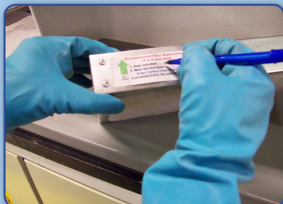
1. Remove new filter from plastic wrap, and write the change date on the label.