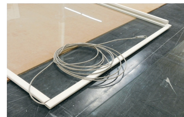
Detail: 1 Cable connecting to sash.