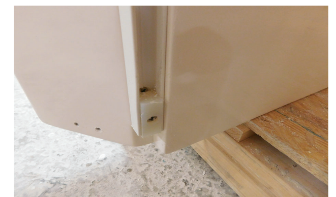
Detail: 2 Sash bottom stop located in track just above airfoil.