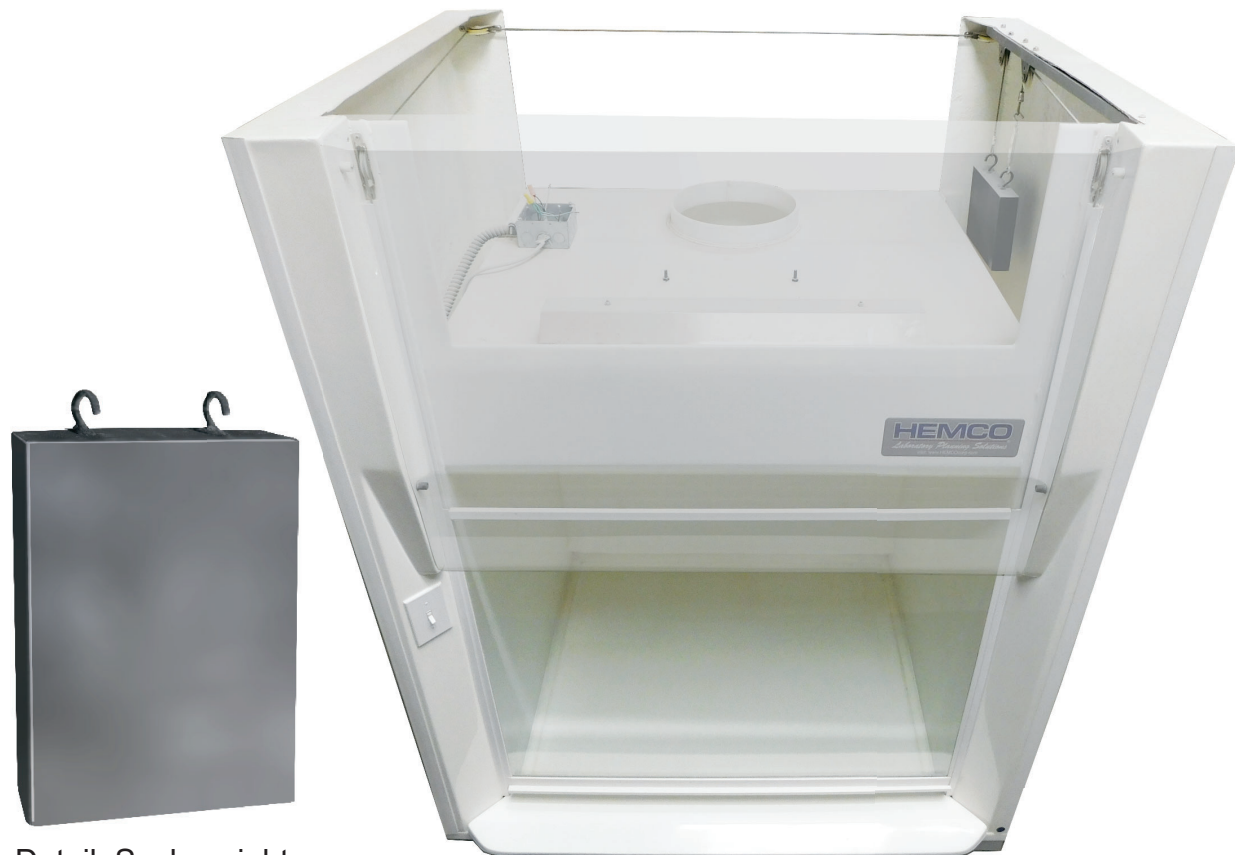
Detail: Sash weight